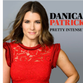
PRETTY INTENSE Danica Patrick To be released in 2023